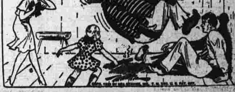
Nice Work, Pup