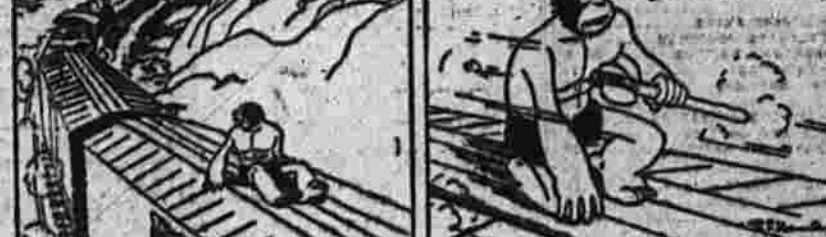
Curiosity Killed the Cat