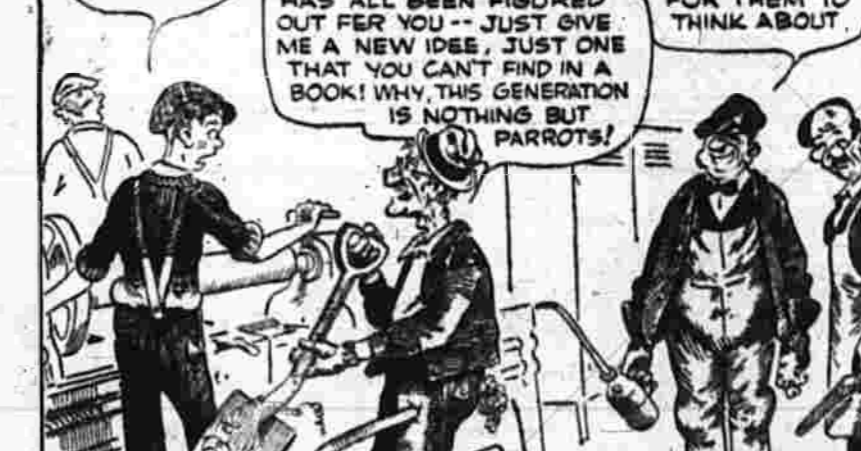
OUR BOARDING HOUSE ..... WITH N..... MAJOR HOOPLES