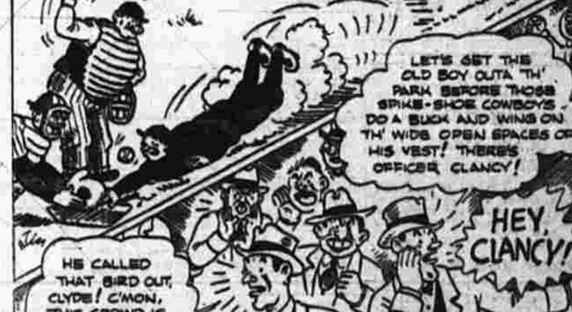
OUR BOARDING HOUSE ..... WITH N..... MAJOR HOOPLES