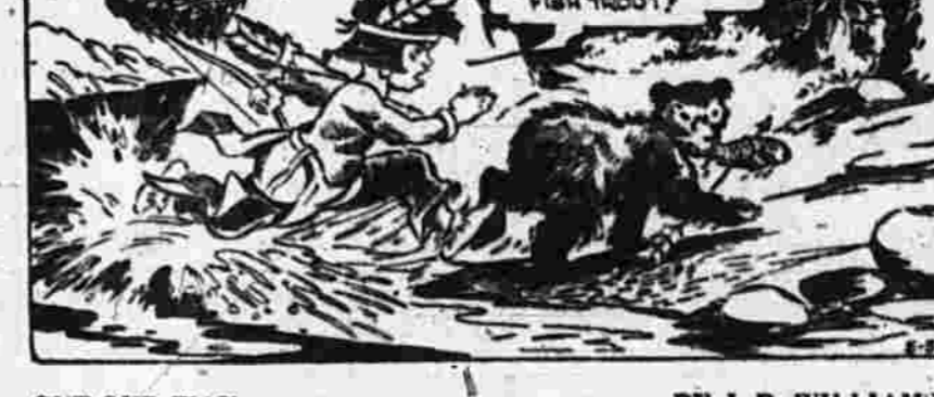
Look Out, Little Beaver